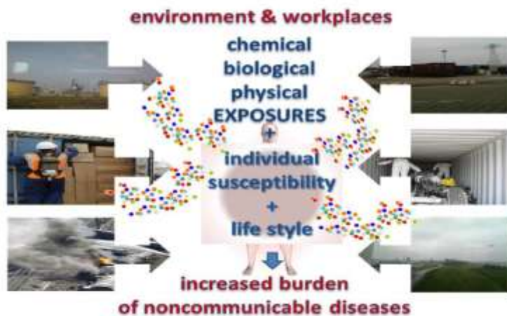
Figure 1. Risk to general public from new unknown hazards transported through Europe's infrastructure of highways, railways and waterways, has emerged with the global production, new technologies, and distribution of products. This leads to the need for new diagnostic approach -detecti-on-management systems, risk communication and risk management planning and prevention. Goods produced in low income countries are often treated with pesticides leading to health problems for employees and consumers. Distribution centres transfer unopened transport units (with raw materials, production parts or products) from a seaport to millions of inland destinations throughout Europe. There is also an increasing transport of e-waste to the recycling centres in Europe comprising new health risks from old hazards.